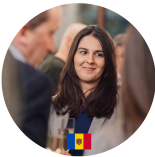
Elena Zagnat Agora.md (Moldova)

In May, Iulia focused on EU policies in relation to the Black Sea region, Moldova, and Hungary. She reported on the European Commission's new strategy for the Black Sea , which aims to bolster regional security and cooperation with partners including Moldova and Ukraine. In Brussels, she covered a key hearing on Hungary's controversial transparency law, highlighting the risk of sanctions under Article 7. Iulia also reported on growing momentum for Moldova's EU accession, with Commissioner Marta Kos expressing optimism about opening key negotiation clusters. Her coverage underscored the EU's broader efforts to strengthen ties with Eastern partners amid ongoing geopolitical tensions.