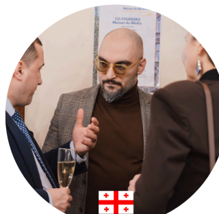
Vazha Tavberidze Radio Free Europe/ Georgia Today